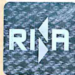
Hai Wen Zhang

This Certificate consists of this sheet plus an attachment